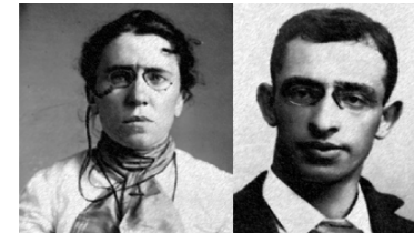
Emma Goldman and Alexander Berkman