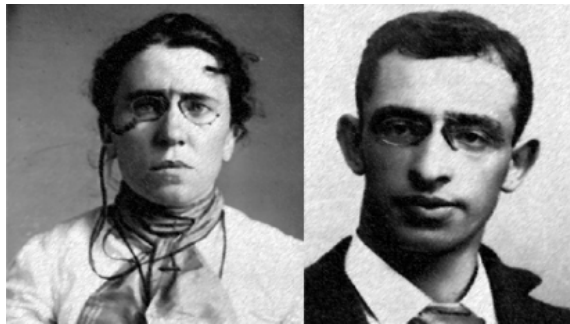
Emma Goldman and Alexander Berkman