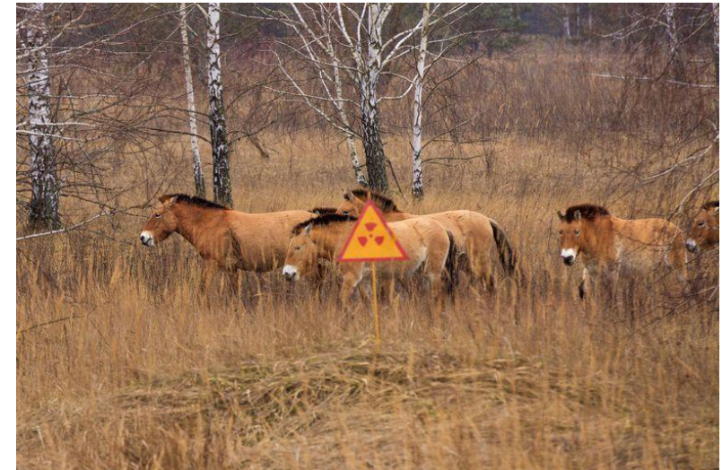
Some pro-nuclear mascots