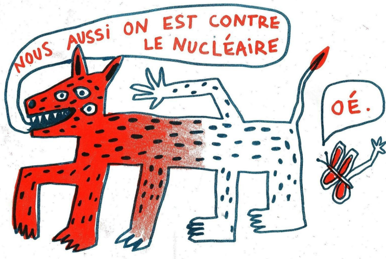
We are also against nuclear power. Yep.

this research, regardless of whether they are pro- or anti-nuclear, attach far more importance to efficiency than to animal welfare and dignity, resorting to breeding in laboratories, deprivation of freedom, slaughter, etc.