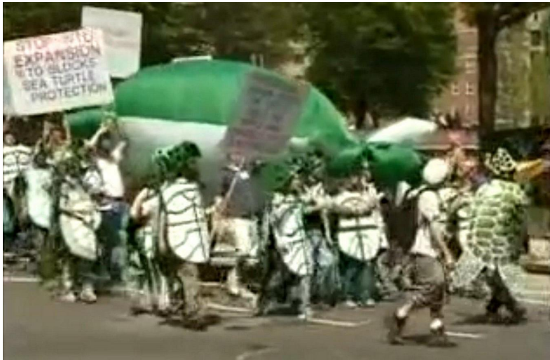
Demo against the destruction of sea turtles at the hands of Saint Lucia nuclear power plant