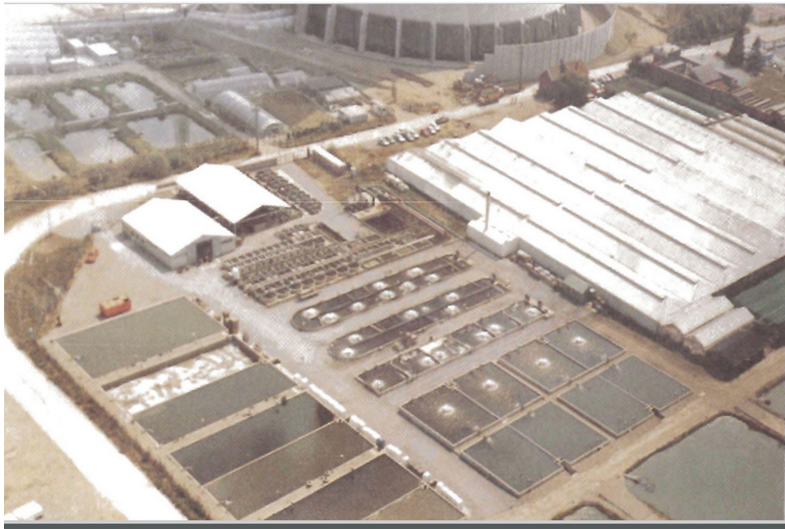
*Intensive fish farming of tilapia, carp and catfish at Tihange in Belgium using water from the nuclear power station, photo taken in 1991.