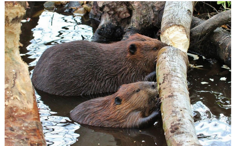
Beaver (Castor in french)