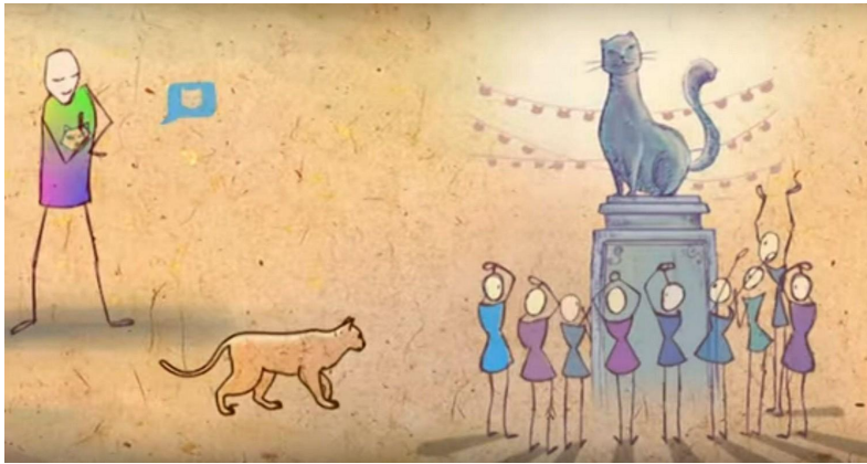
(The solution) Radiocat

Competition for food leads to aggression, fin and tail biting and even cannibalism. This phenomenon is exacerbated by the fact that some fish grow faster than others. This is why they are periodically sorted by size (the sorting takes place five times). (...)