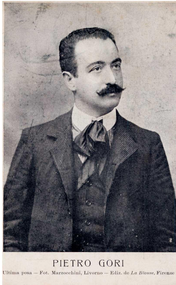
Figure 1 Pietro Gori.