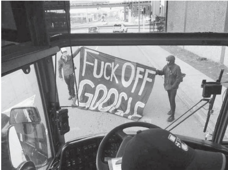
Oakland, 20. Dezember 2013