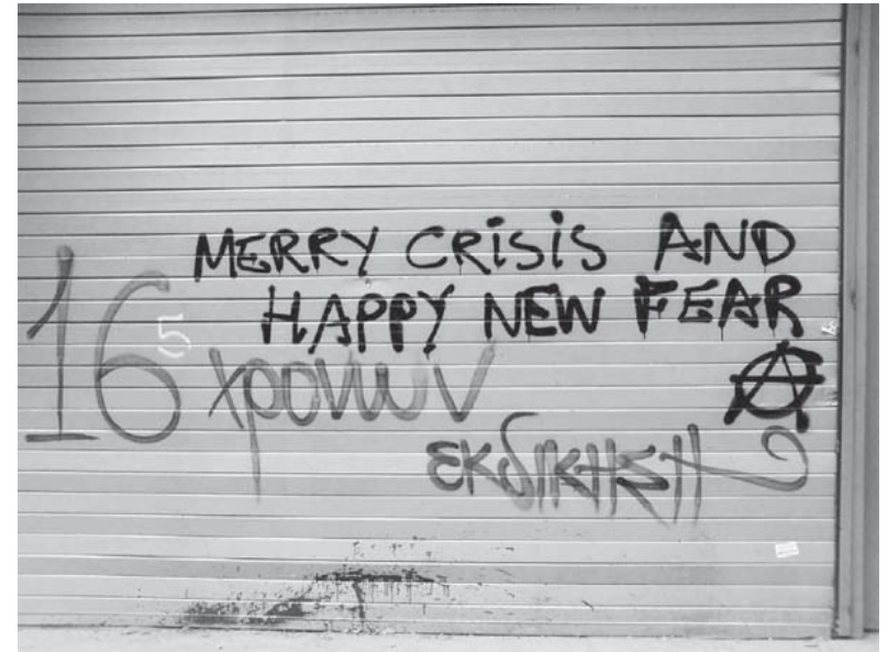
Athens, December 2008.