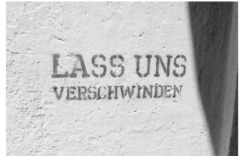
Istanbul, June 2013.