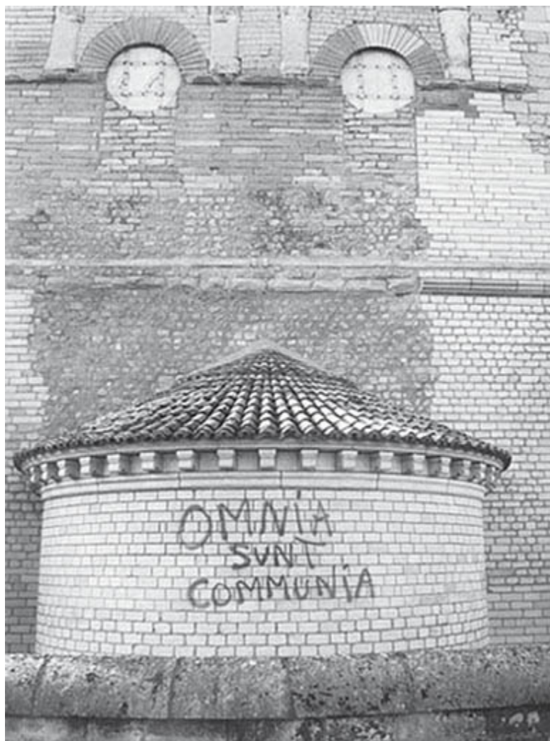
Poitiers, Baptistery of St. John, October 10, 2009.

lar. But whenever one of these dimensions loses contact with the others and becomes independent of them, the movement has degenerated. It has degenerated into an armed vanguard, a sect of theoreticians, or an alternative enterprise. The Red Brigades, the Situationists, and the nightclubs—sorry, the “social centers”—of the Disobedients are standard formulas of failure as far as revolution goes. Ensuring an increase of power demands that every revolutionary force progress on each of these planes simultaneously. To remain stuck on the offensive plane is eventually to run out of cogent ideas and to make the abundance of means insipid. To stop moving theoretically is a sure way of being caught off guard by the movements of capital and of losing the ability to apprehend life as it’s lived where we are. To give up on constructing worlds with our hands is to resign oneself to a ghostly existence.