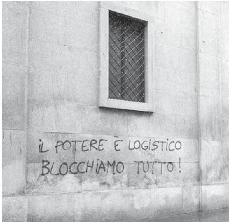
Turin, January 28, 2012.

administration. That program starts from the premise that the governmental function should consist in linking up citizens and making available information that's now held inside the bureaucratic machine. Thus, according to New York's city hall, "the hierarchical structure based on the notion that the government knows what's good for you is outdated. The new model for this century depends on co-creation and collaboration."