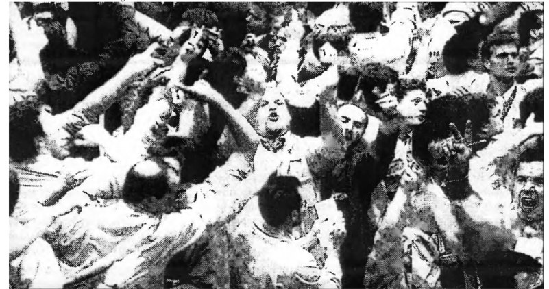
The Frankfurt Stock Exchange