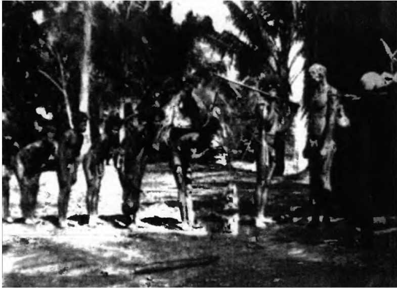
Adam Smith's homo economicus in its natural environment, engaged in financial speculation from the depths of the cave.