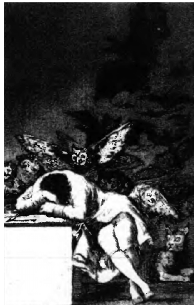
Goya, The Sleep of Reason Produces Monsters .

Posed as separate, the individual and the [human] race remain abstract. It is only in their relationship – insofar as the race takes form in individuals, and the individual can only define him or herself as an individual, that is, as a social being, within relationships , which draw their substance from the race – in their being for one another, that they attain concreteness. The unity in which these moments, the race and the individual, are as inseparable, is at the same time different from them; it is thus a third term alongside them, which is found precisely to be none other than Publicity itself, that which forms the absolute basis for relations or exchange as pure exchange.