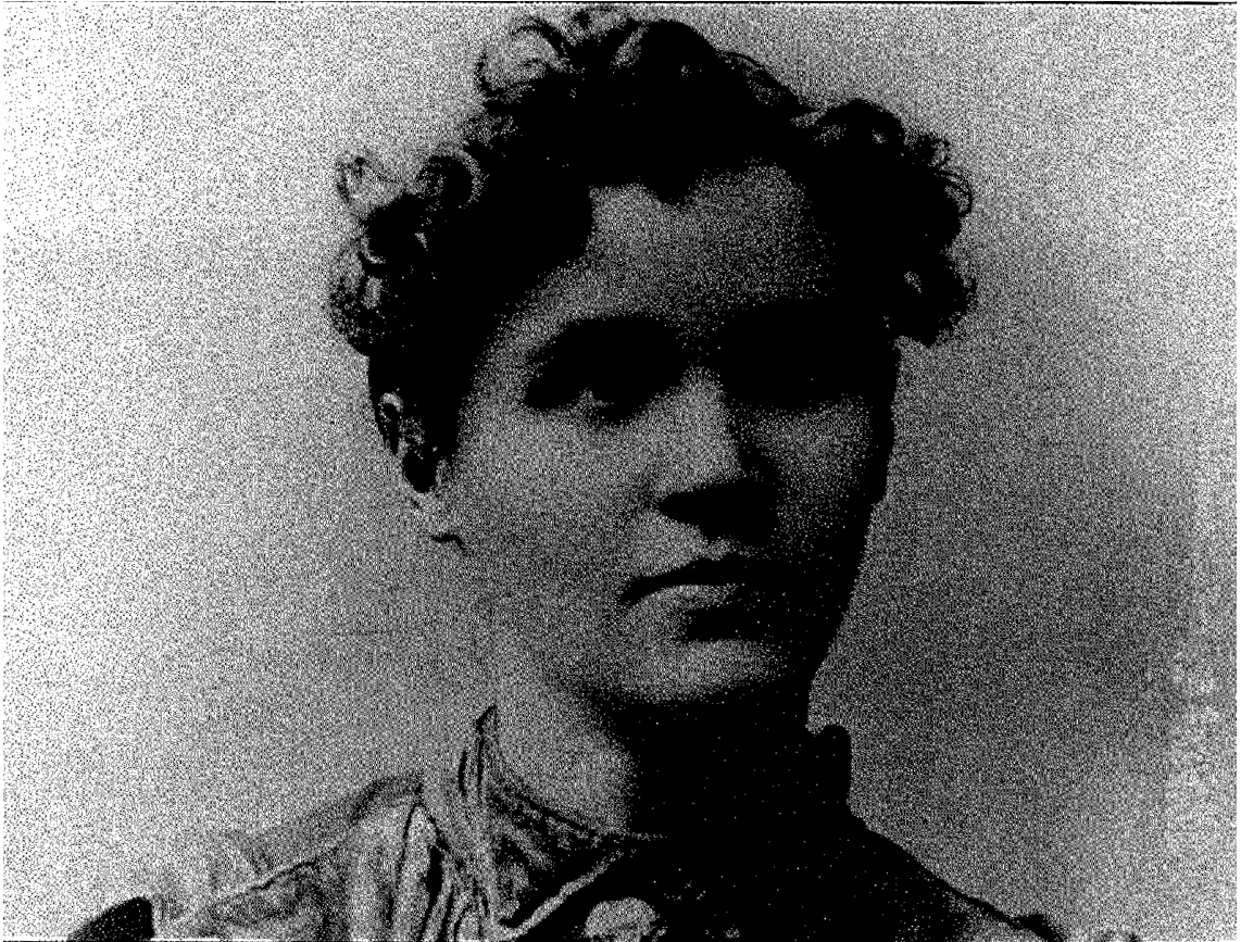
Voltairine de Cleyre (1866-1912)