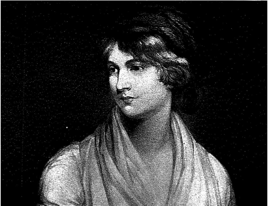
Mary Wollstonecraft (1759-1797)