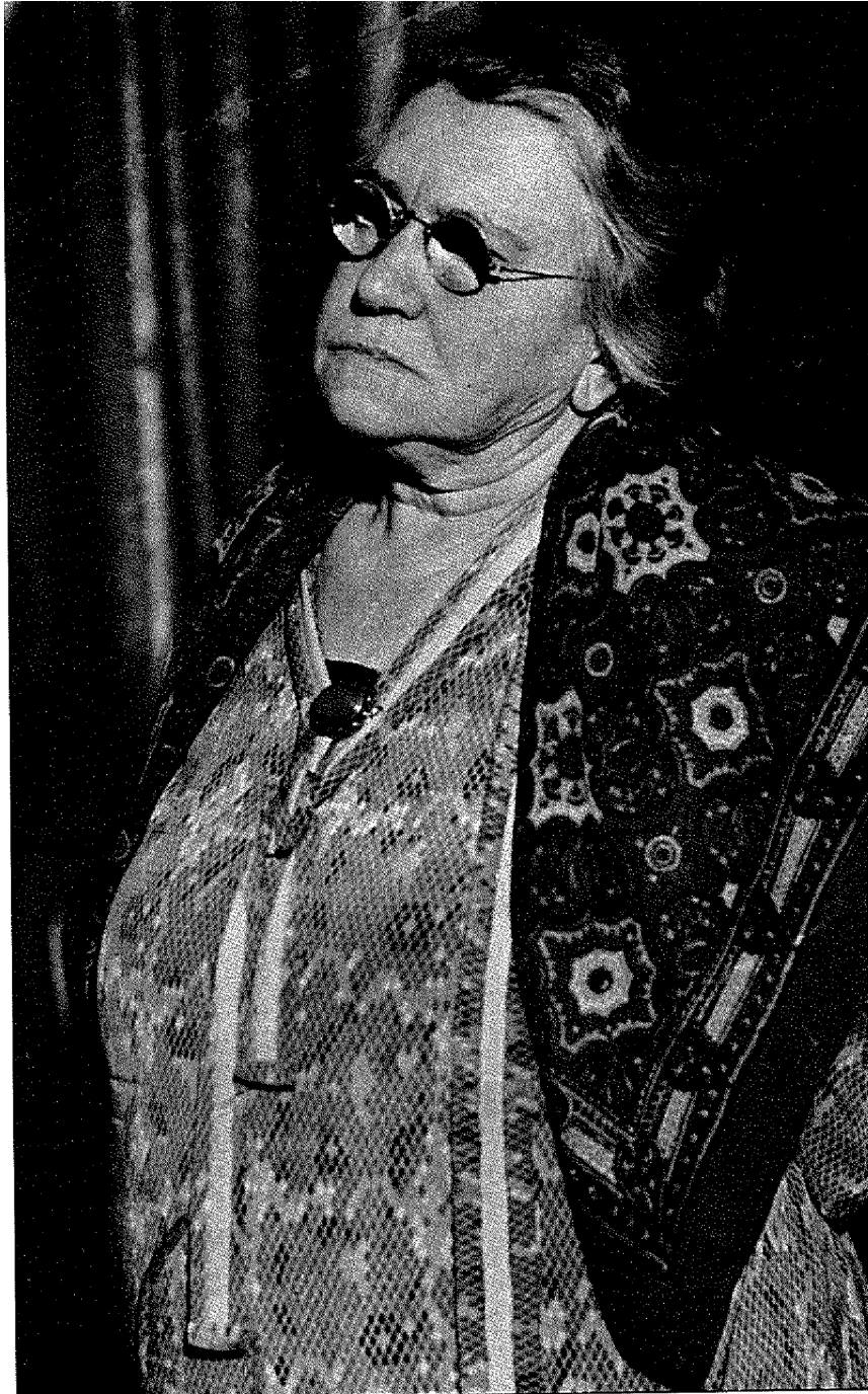
Emma Goldman (1869-1940)