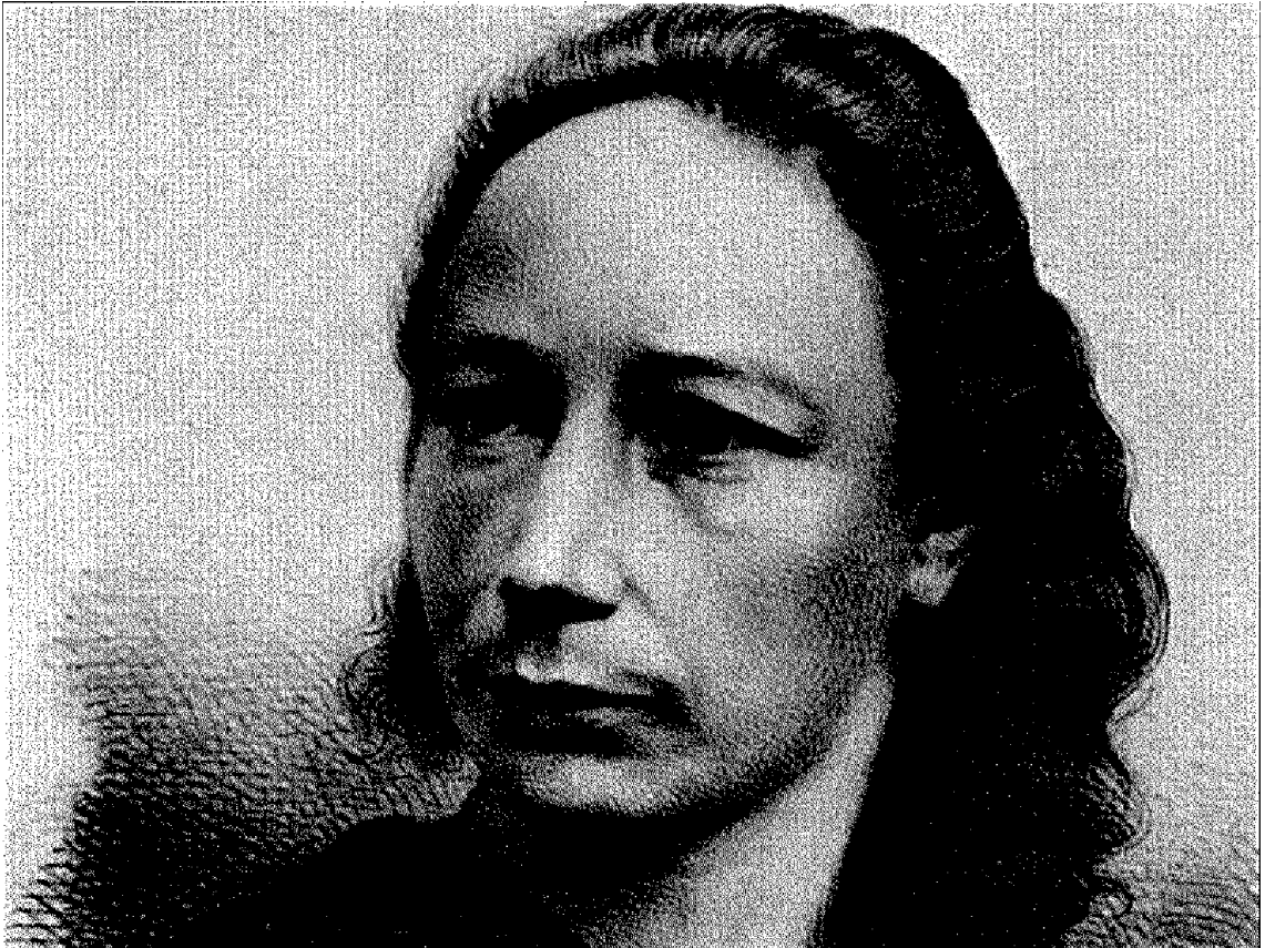
Louise Michel, drawn from life, 1880