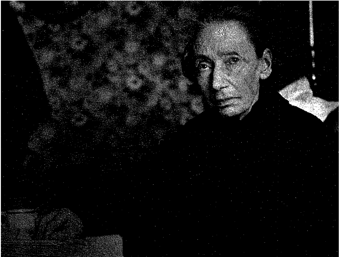
In old age Louise Michel (1830-1904)