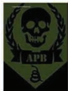
American Patriot Brigade